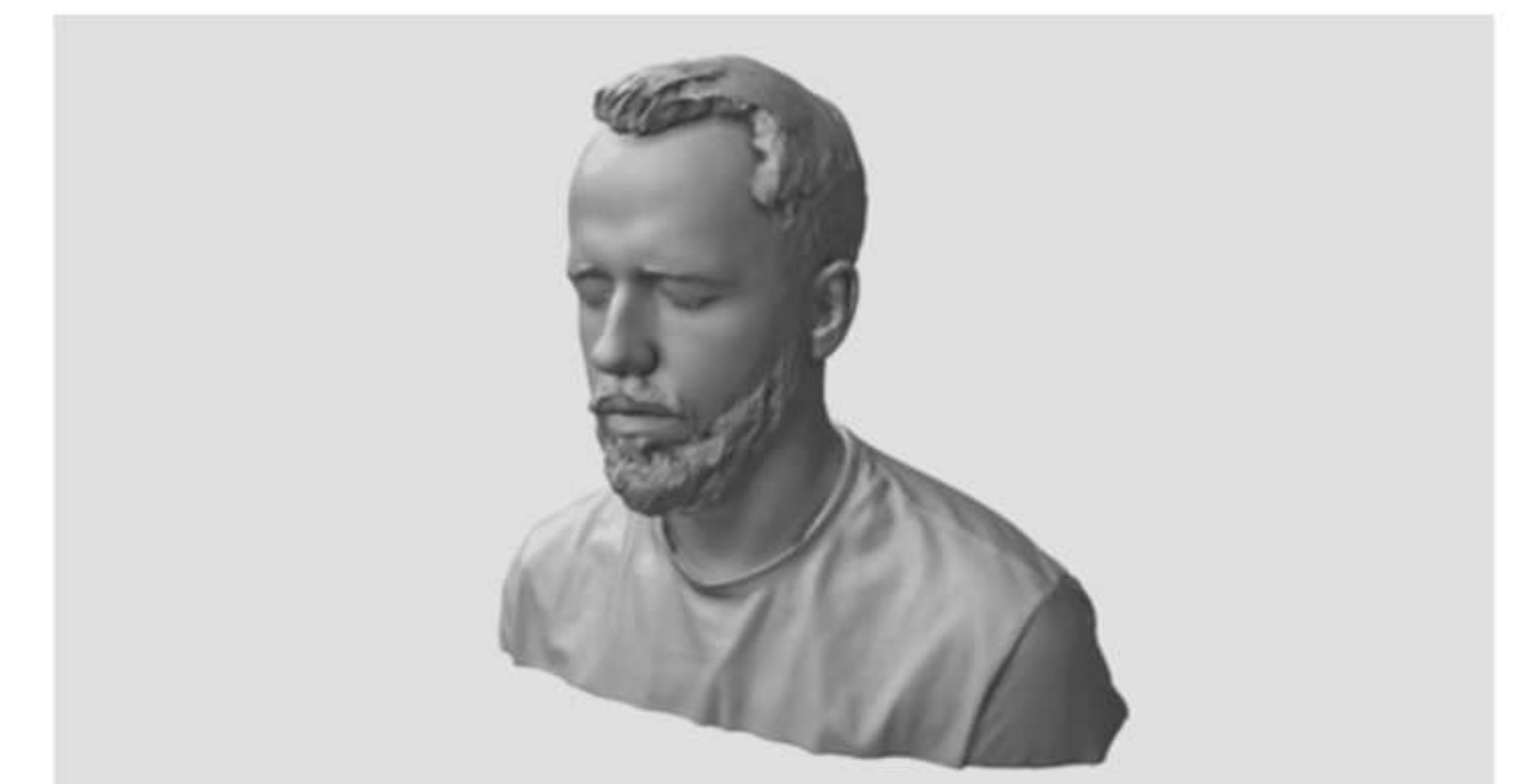
| Statues, and the human body