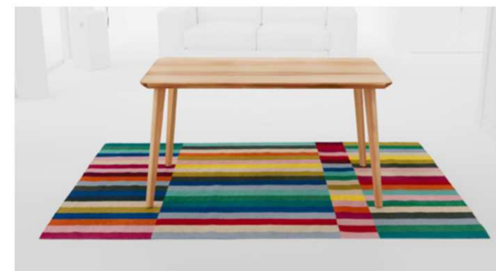
| Furniture and room interiors