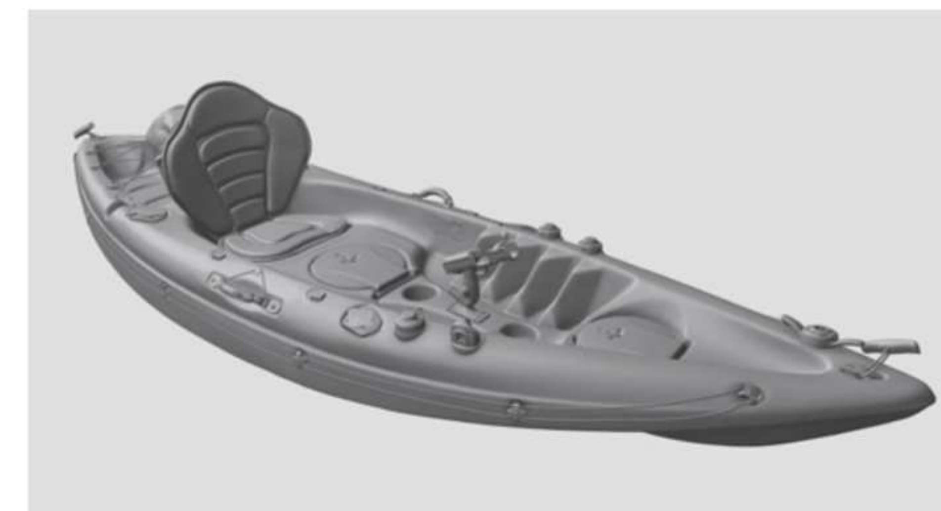
| Turbines, ship propellers, small boats