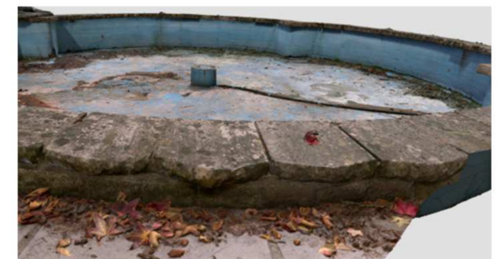
| Crime scenes